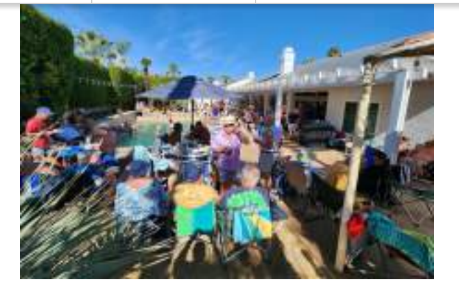
Pool Party

(formerly the Desert AIDS Project's AIDS Walk). Our participants raised nearly $800 for this event, exceeding our internal goal. We also participate in the annual Harvey Milk Diversity