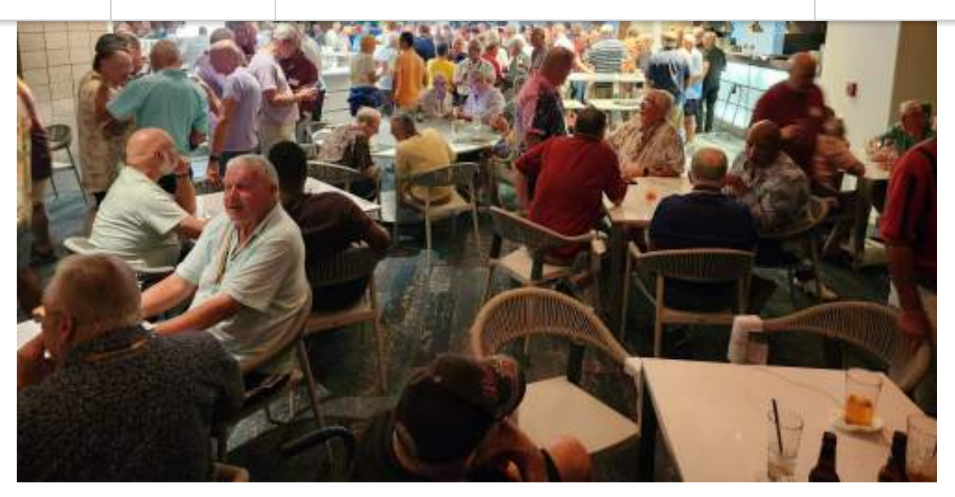
Palm Spring Mixer - Photo by Alex Meyer

Our recurring activities include our notorious weekly Monday mixer at the renown "Escena" Golf Club. We generally enjoy cocktails with about 250-300 gentlemen, who often then head out on the town for impromptu small group dinners. We also meet every Thursday for a "drop in" breakfast at a local IHOP, with generally about 20 or so pancake fans...waffles or eggs are OK too!