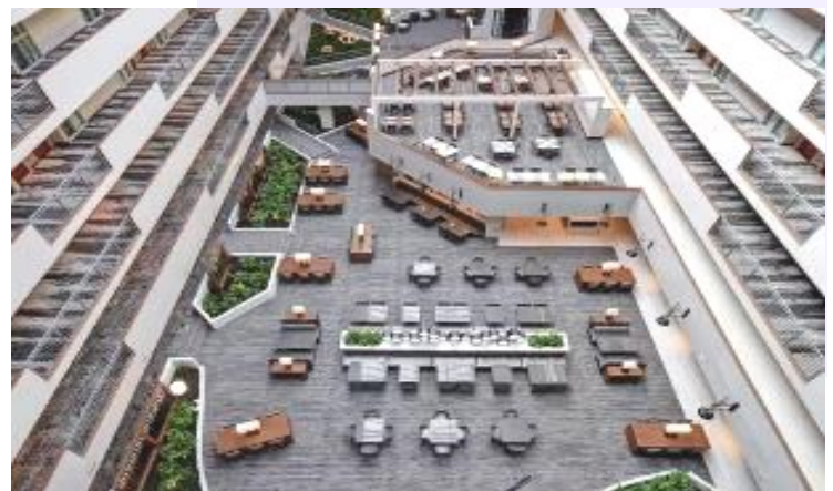
Lower Atrium seating area for socializing near bar.