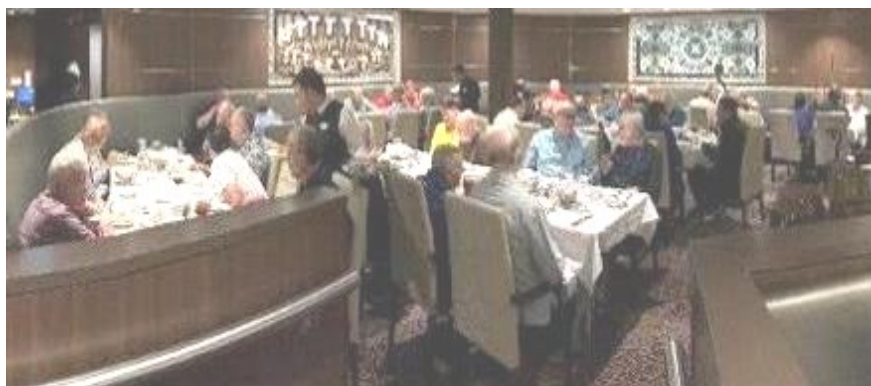
Optional dinner socializing on the 2024 PTWW Cruise on Harmony of the Seas .