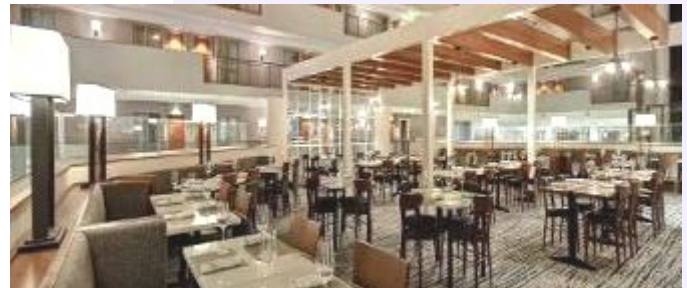
Free breakfast is served to hotel guests in Lower Atrium.

Reservations discount codes will be provided when your individual convention application has been received.