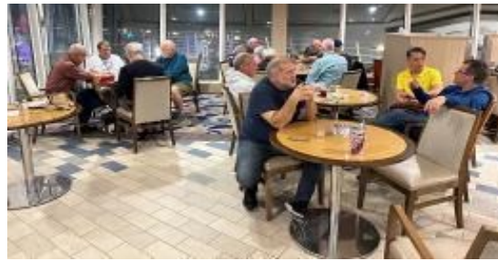
Canasta, dominoes, bridge, and just talking in the evenings.